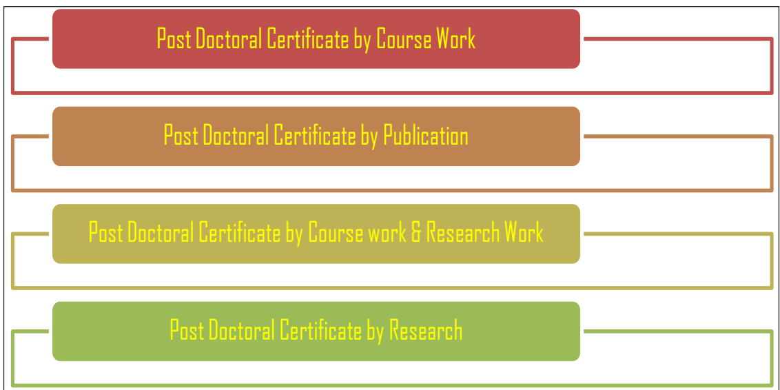
Fig. 1: Possible Post Doctoral Certificate with a variety

Therefore the Post Doctoral Certificate can be offered based on the need and demand of the candidates. Moreover, candidates with interested in publication or having publication can go with research/ publication mode. In contrast, candidate interested in learning new things can go with the coursework mode (refer Fig. 1 as well).