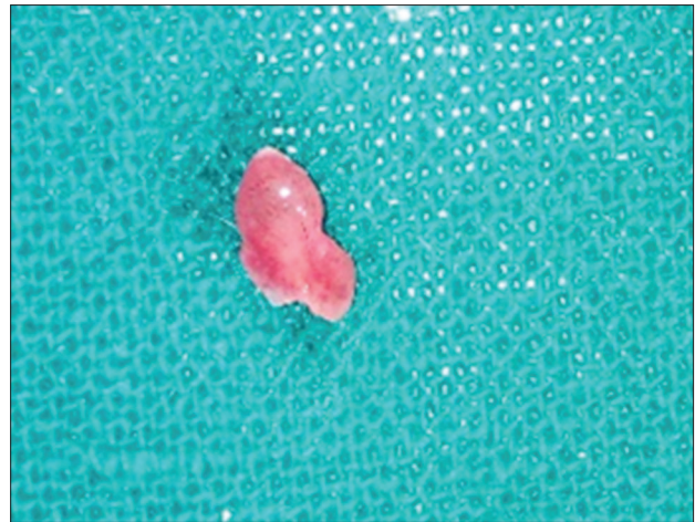
Figure 4: Gross specimen of excised tissue