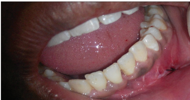
Figure 3: Suturing done