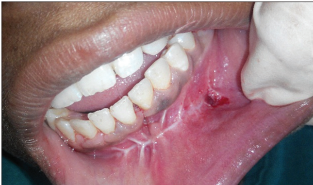
Figure 2: Complete excision of lesion