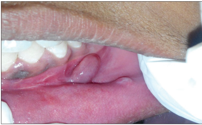
Figure 1: Well circumscribed lesion